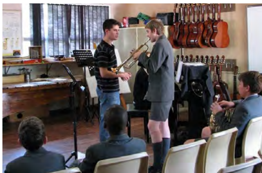
Tuning for a Trumpet Recital