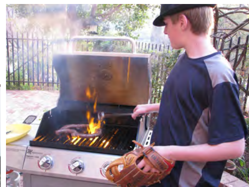
Learning to Braai, July 4