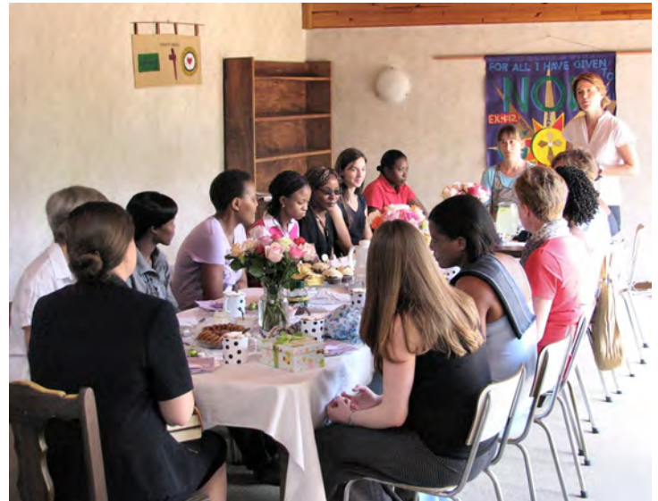
End of Year Tea Hosted by Ladies of our Local Lutheran Congregations

One photo in the brochure shows the practical lesson at the end of the first-semester course on Worship and Altar Guild. We met at nearby St. Paul's together with a pastor, and practiced handling the communion vessels and setting up/clearing the altar. On that day, none of the women previously had any expe-