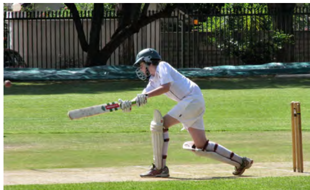
Batting in a Cricket Match