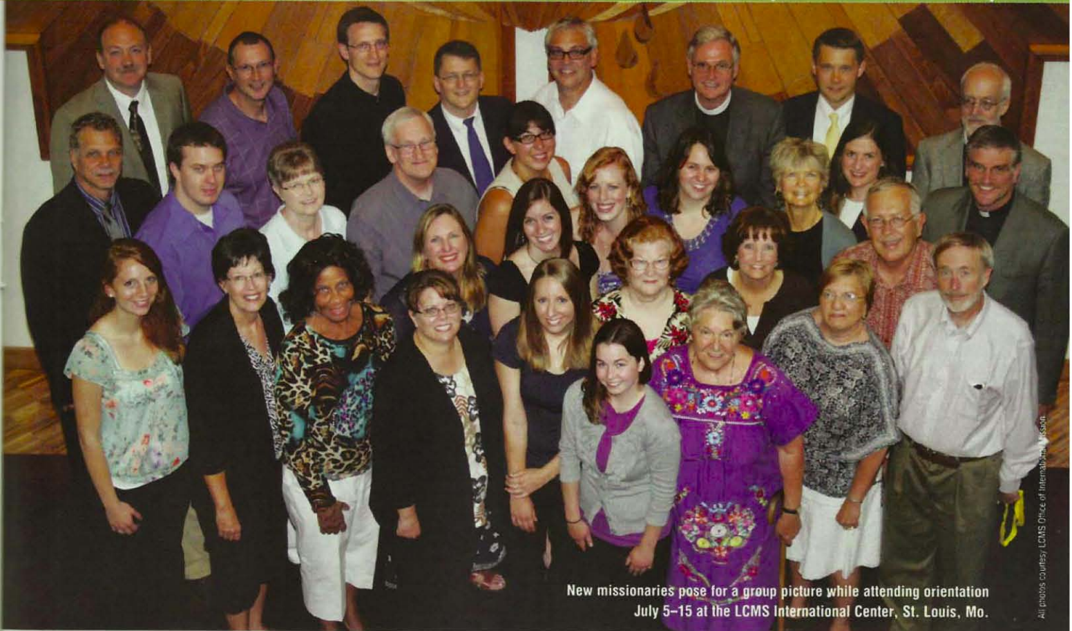
New missionaries pose for a group picture while attending orientation July 5–15 at the LCMS International Center, St. Louis, Mo.

All photos courtesy LCMS Office of International Mission